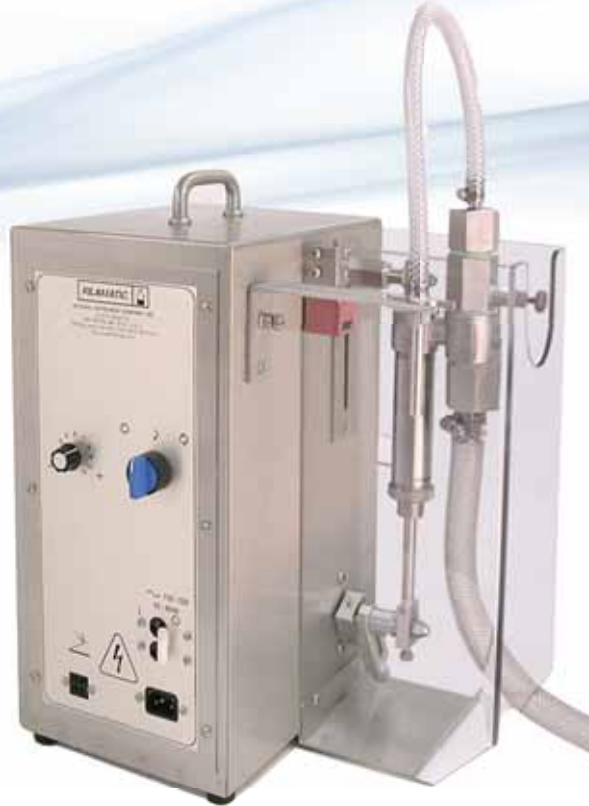
AB Series Medium Duty Benchtop Filler