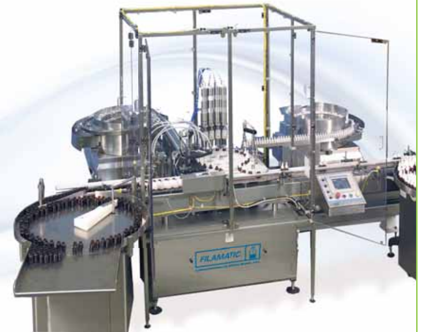
MNB XT High Speed A faster version of the MNB 2000