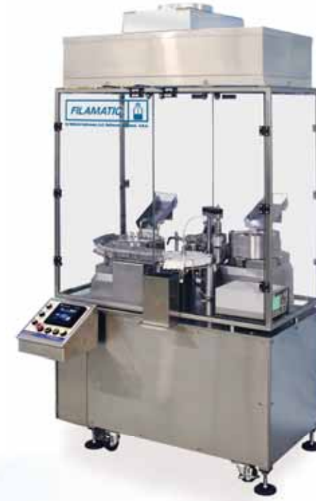
Mini-Monobloc Ideal for small productions runs