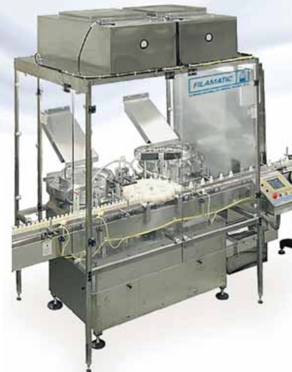
MNB 2000 A complete fill/finish packaging system